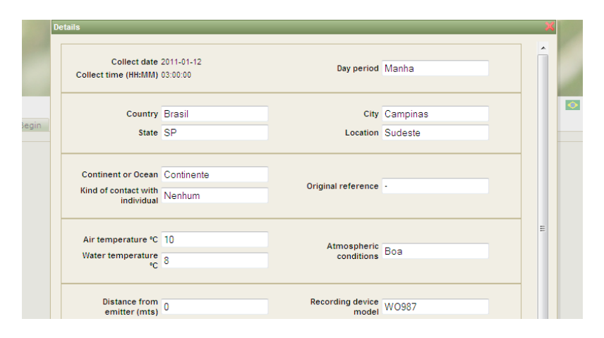
Figure 2. Form containing details about one sound record metadata