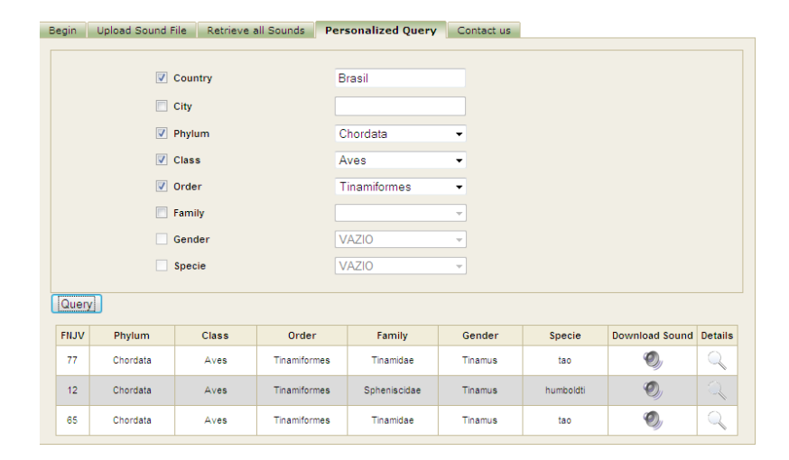
Figure 3. Form to perform metadata-based queries