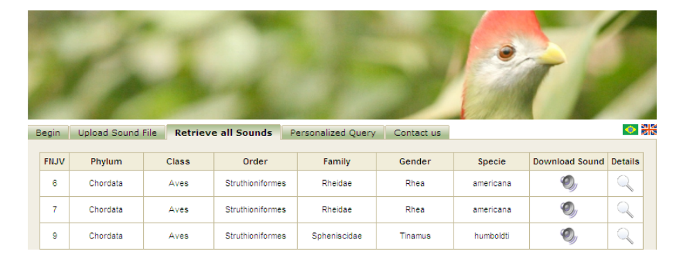
Figure 1. Page to navigate the whole collection of bird sounds