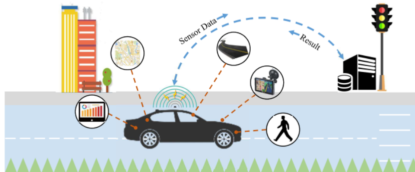
Figure 1. A smart vehicle perceives the environment through sensors and exchanges messages with the server. Usually, the vehicle sends the data to the server; then, the server updates the model; and sends the response to the client. Adapted from Zhang and Letaief's [2019].

Federated Learning (FL) is a recently proposed ML paradigm that allows to collaboratively train a shared model for many users without direct access to raw data [Konečný et al. 2015; McMahan et al. 2016]. Users train a ML model on the local data set and upload it to a server for a global model aggregation [McMahan and Ramage 2017]. However, moving data to a central server for training introduces a prohibitive communication overhead [Zhang and Letaief 2019]. According to McMahan and Ramage [2017], the device downloads the model trained in the Cloud with a large set of historical data, enhances it by learning from the data on the devices and summarizes the changes as a small, focused update. Only this update for the model is sent to the Cloud, using encrypted communication, where it is immediately averaged with other user updates to improve the shared model. All training data remains on the device and no individual updates are stored in the Cloud. FL has an increasingly important role to play in many applications, for example, healthcare, finance and transportation [Lim et al. 2019]. FL is used in our architecture to operate an intelligent, real-time traffic estimation at the edge of the network.