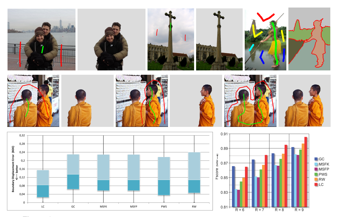
Figure 3. 1st row: segmentations produced by the proposed approach. 2nd row: flexibility in generating multiple partitions. 3rd row: comparison of our method (LC) against Graph Cuts (GC), Maximum Spanning Forest with Kruskal and Prim's algorithms (MSFK, MSFP), Power Watershed (PWS) and Random Walker (RW) [Grady 2006, Cousty et al. 2009, Couprie et al. 2011] for BDE and F-score.

<sup>1</sup>https://www.youtube.com/watch?v=IbhxpmtFa0Q