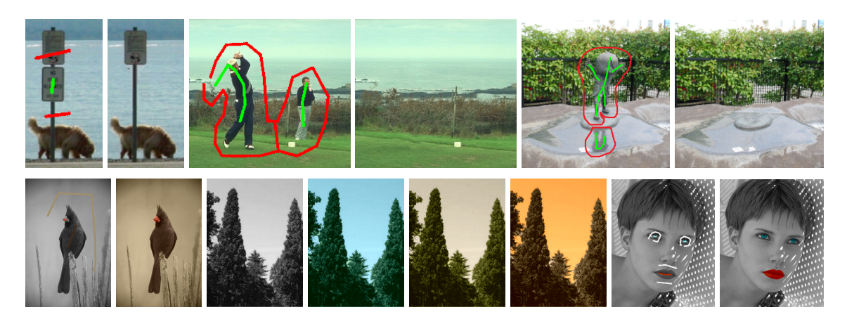
Figure 4. Image inpainting and colorization examples obtained from the proposed algorithms.