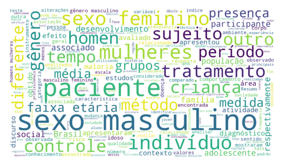
Figure 2. Main topics discussed in the "Mascul" CSV file.

embedded into a HTML file. A Python code was developed for processing the modified CSVs and creating and saving a JSON tree description of the amount of dissertations and thesis, grouped hierarchically by region, institution, theme and main topics. By opening the HTML file, the treemap is shown and the user can drill in and out through the data levels. Figure 3 illustrates such a treemap.