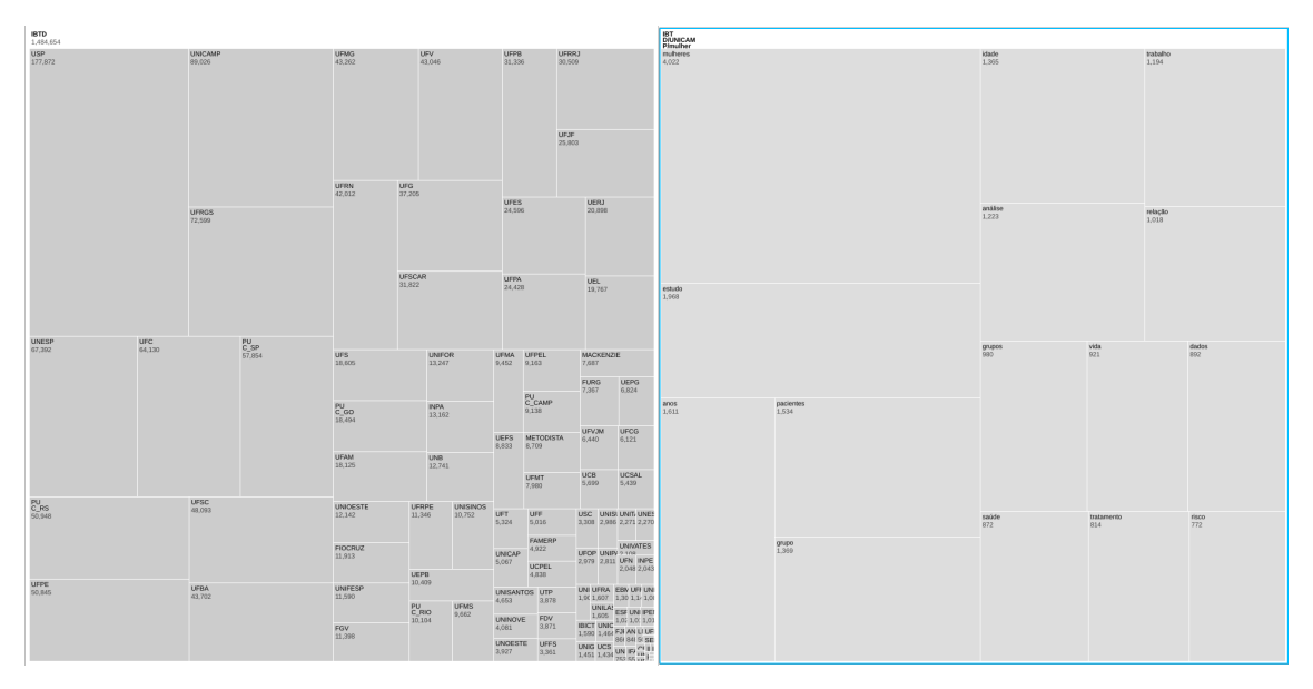
Figure 3. Treemap for exploring the presence of the main discussed topics.

embedded into a HTML file. A Python code was developed for processing the modified CSVs and creating and saving a JSON tree description of the amount of dissertations and thesis, grouped hierarchically by region, institution, theme and main topics. By opening the HTML file, the treemap is shown and the user can drill in and out through the data levels. Figure 3 illustrates such a treemap.