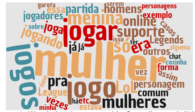
Figure 1: Word cloud presented in Carvalho et al. (2017)

This work does not deepen the questionnaire or its results, this step has already been done in Carvalho et al. (2017). As results: (i) Sexism, positive or negative, affects mainly women; (ii) All questionnaire respondents believe that there is sexism in digital games; (iii) Most respondents, both men and women, believe that education is a way to solve the sexism behavior, in line with UNESCO (2002); (iv) LoL is the most quoted game associated to sexism in digital games. A word cloud was generated using the questionnaire responses and LoL (League, Legends, LoL) appeared in a relevant number, as illustrated by Figure 1.