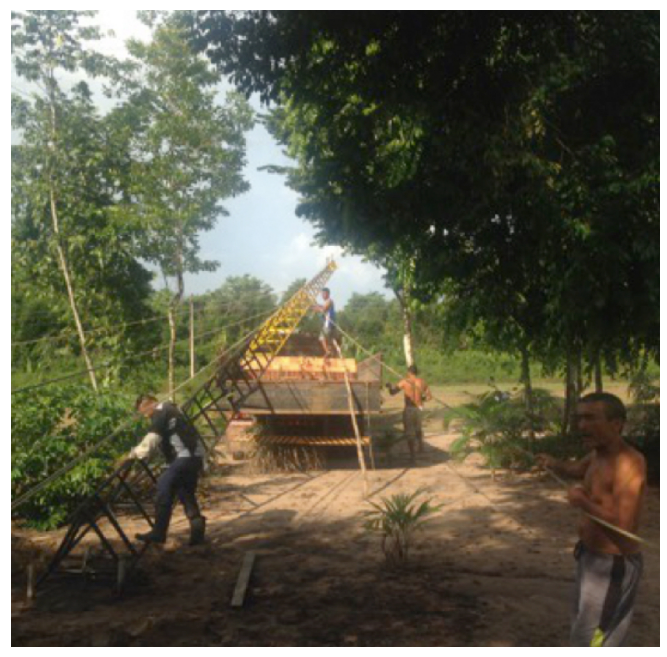
Figure 2. Installing the tower that carries the internet antenna in the center of the community.

gain the necessary knowledge to install and maintain infrastructural components.