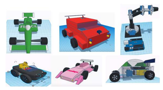
Fig. 2. Examples of final project developed by the students.

completely new. In Figure 2, some models developed by the students in the final step of the STEAM methodology are presented.