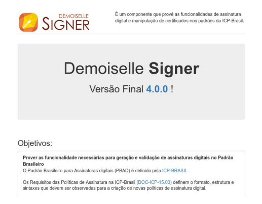
Fig. 2. Demoiselle Signer page top.

Demoiselle Signer is used by Assinador Serpro [11], a Java desktop application for signing documents with digital certificate or validating digital signed documents. Assinador Serpro uses Demoiselle Signer, but it is not a FLOSS. There are available free binaries for Assinador Serpro in Serpro website, however the source code is not open.