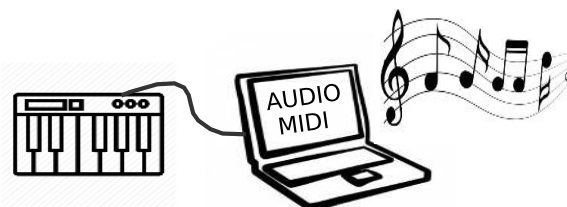
Figure 1: General view from 3A

The 3A utilizes a midi synthesizer device connected to a desktop or notebook computer by processing this data from the Chuck language to output audio or midi, as shown in figure 1. For this initial works, the 3A consists in a SOM with MIDI inputs and output. The inputs are 3 MIDI notes played temporarily, the output is MIDI note played as a melody to suggestions for accompaniment to musician in real time. Based on inputs, the 3A decides the harmonic field played by musician. The harmonic field is the map of learning and its neurons are the notes played temporarily, as seen in figure 2.