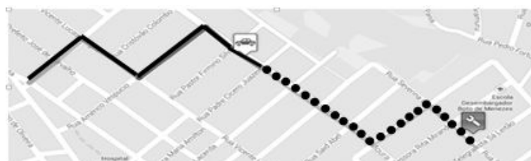
Figure 2: Real-time simulation of a trip, with prediction of destination and remaining route