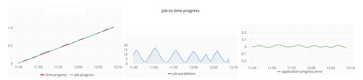
Figure 2. Task execution in the Grafana dashboard provided by Asperathos.

Figure 2 depicts an example of execution that can be visualized using the Asperathos visualizer tool. The graphics show a KubeJobs plugin execution, the first one depicting the task progress relative to the time passed, the second showing the scaling of the replicas when necessary, and the last graph is the application error, which is the ratio of the task progress and the time spent. For this visualization, Grafana<sup>8</sup> was used, together with an Influx Database<sup>9</sup> as the metric source.