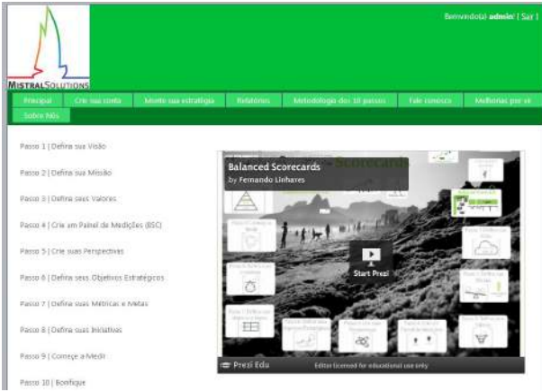
Figure 2: Mistral Solutions System

would lead them to create their BSC, it is not possible to determine the exact number that would provide a label “good” for a fuzzy variable related to monthly income. Renooij and Witteman [17] researched how to relate a numeric scale to words and called it verbal anchors. For a specific value in this scale there is a word that is used as a probability measure for an uncertainty variable. The Figure 3 presents a hybrid scale with verbal anchor and number extracted from [3].