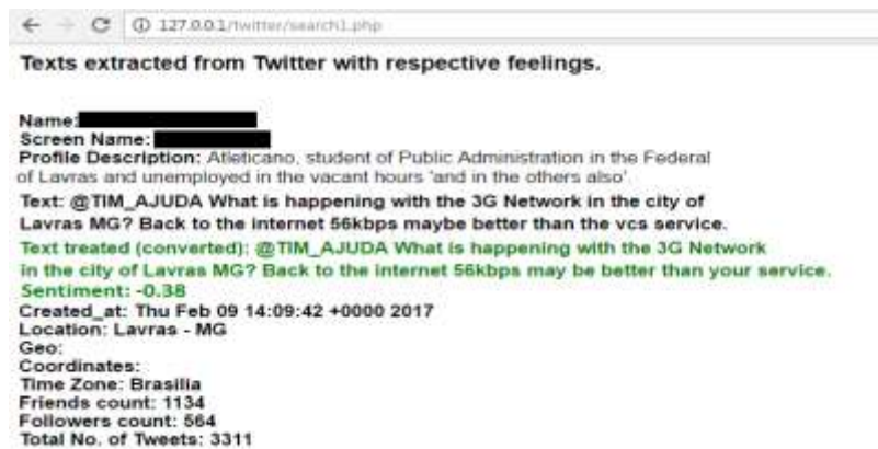
Figure 2. Sentence and parameters extracted from the social network.

Note that in the sentence presented in Figure 3, the user of the social network had a problem with the Internet in the region of Lavras - Minas Gerais (MG), Brazil. We related the results of the social network sentence containing the complaint with the results obtained from the ANATEL application, shown in Figure 3, which shows the base stations of the geographic region of the user, the Lavras city. In the Figure 3 each color of the circles represents a different telecommunication company, the red color represents a specific company, the yellow color represents another, and so on.