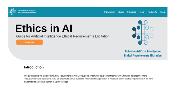
Figure 1. Home page of the guide.

The Guide for Artificial Intelligence Ethical Requirements Elicitation was implemented as a web-based system and is divided into: Introduction, presenting a brief introduction and how to use it; Guide, presenting the set of cards; Principles, presenting all the principles present in the guide; Tools, presenting which tools are present in the guide related to the principles; Trade-offs, presenting which trade-offs may occur when developing AI-based systems that take ethical issues into consideration; and About, briefly presenting the authors, information about the guide and references used. In Figure 1 we present the initial screen of the guide, where its subdivisions are present.