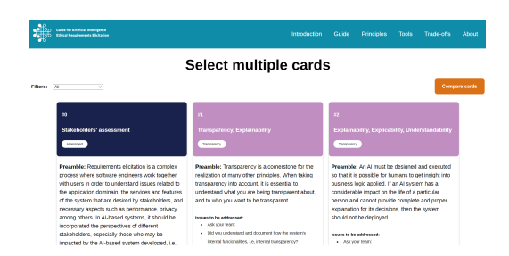
Figure 2. Card selection page.

Anais Estendidos do XVIII Simpósio Brasileiro de Sistemas de Informação (SBSI 2022)