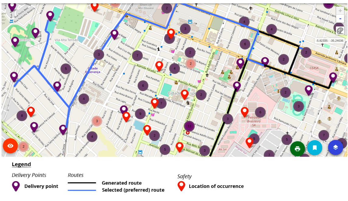
Figure 2. Overlapping routing and safety layers in SGeoL.

approach consists in: (i) characterizing the different dimensions according to the chosen domains, (ii) defining a function to assess the quality of a route considering each dimension; and (iii) defining a utility function to assess each route by freely weighting each dimension. The implementation of the approach was done upon SGeoL, a smart city georeferenced platform. The proof of concept was instantiated in Natal, a city in Northeastern Brazil, and shows the results of correlating routing data with public safety information.