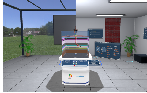
Fig. 2. The glass (left) and office (right) rooms virtual environments.

close to the real environment. The solution was to build a "glass room" with a customizable background (Figure 2).