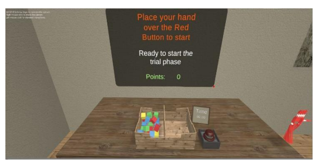
Figure 2: iVR environment for the Box and Blocks Test