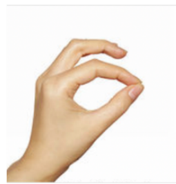
Pinch to Select. Pinch and Drag to Scroll