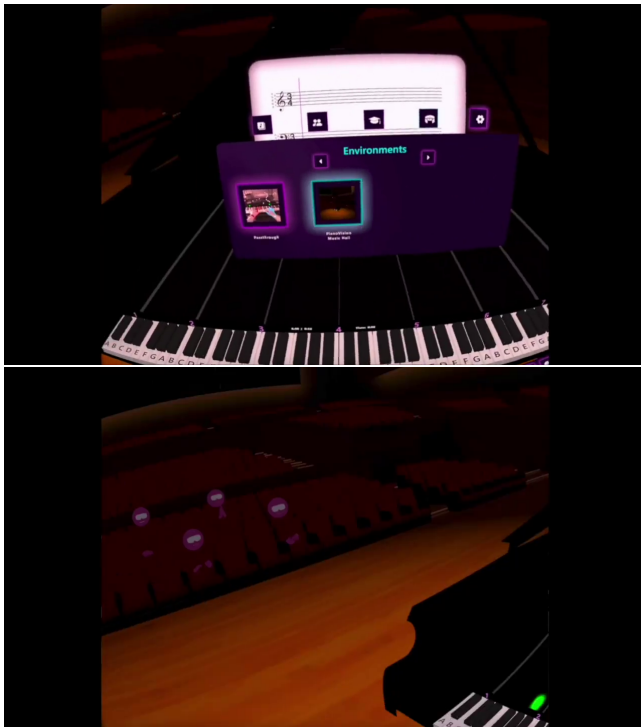
Figure 3: Possibility of changing the virtual scenario. Audience is also possible in the virtual hall.