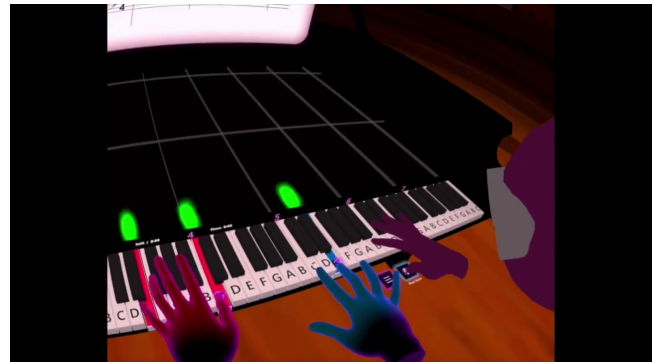
Figure 2: Two players interacting in PianoVision.

the keys is still a challenge in the virtual piano option, but it works flawlessly using the MIDI input provided.