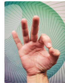
Look at your raised palm and pinch to return to System Menu