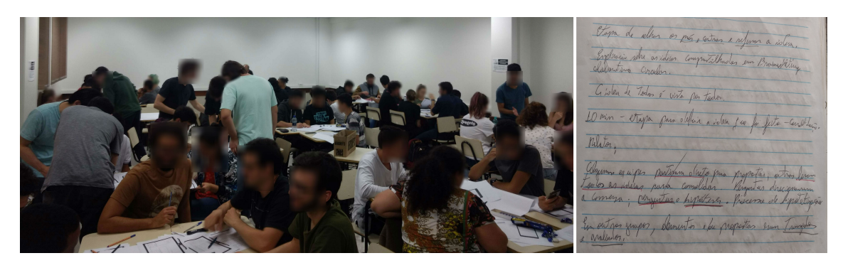
Figure 1. Students in classroom and diary picture

As data collection method , the observation technique was applied. The first author acted as a teaching internship for the discipline, and supported students in solving doubts during their activities. Observation can be classified as systematic, as it was carried out under somewhat controlled conditions: the subject, format and activities of the discipline were known a priori . Design objects produced from practical activities ( e.g. , solution requirements and prototypes) were also used for analysis. A diary was used to register what objects were created or modified in Consolidation activities, how the participants structured the Consolidation process, what tasks they carried out and what was the dynamics of collaborative work among them. Participants' notions for the word "Consolidation" were also noted. Data analysis was conducted under a qualitative approach. Figure 1 shows a record of the classroom (left) and a picture of the observation diary (right).