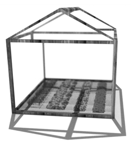
Figure 2. The prototype of a mini-greenhouse

Germination is a process by which the seeds re-perform their metabolic activities from the embryonic axis, thereby emitting their root system [Oliveira et al. 2011]. This biophysical process is regulated by an interaction between its physiological state and environmental conditions, such as temperature and light [Mayink and Mayak 1989; Mondo 2010]. In this way, the system was activated, and the tests were performed, to obtain control about these data. Firstly, the data acquisition was tested by the microcontroller along with IoT communication on the ThingSpeak<sup>™</sup> platform. Figure 3 shows the data measured inside the prototype of Figure 2.