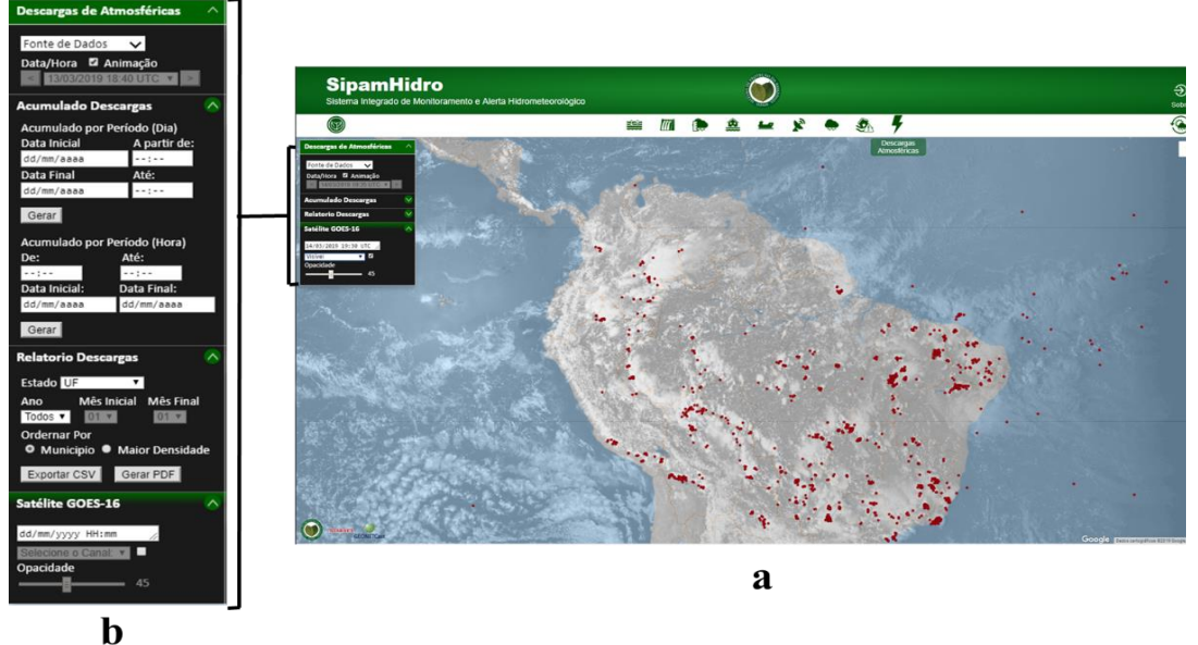
Figure 1: Monitoring system main page with (b) the expansive float menu combining the lightning data from STARNET and the visible image of satellite GOES-16

map. Through parameters and filters controls, the user can interact with the features that configure the data visualization in the map.