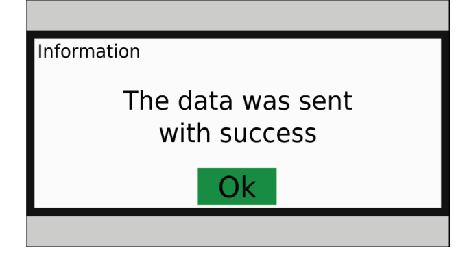
Figure 3: Message Component

The Message component offers two static methods. One of them is used to show a message dialog, which has only one button representing "Ok" action. The other is used to show a confirm dialog, that has two buttons, representing "Cancel" and "Ok" actions. Both display time and can be configured in XML configuration file. One example of the message dialogs with a success message in case study application is presented in Figure 3. The colors of the buttons can be related with the colors existing in the default remote control of set-top boxes.