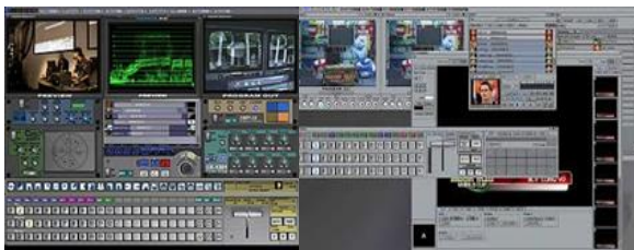
Figure 2: System interface proposed by NewTek Video Toaster 2.