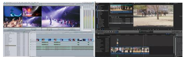
Figure 3: On the left, the interface of Final Cut Pro; on the right, the interface of Final Cut Pro X.

2009). It presented better features and a user-friendly interface, with the possibility of greater interaction and manipulation of the material. In 2011, Apple released an update of this software called Final Cut X. In this new version, the software, which was the most used by professionals in the field, has an interface and a range of effects more similar to amateur software mentioned above. Figure 3 shows the interfaces of Final Cut Pro and Final Cut Pro X.