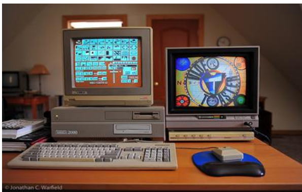
Figure 1: Software and hardware system for video editing in the 1990s, proposed by NewTek Video Toaster.

type of edition we call "linear editing". With the advent of the computer, "editing software" works with hardwares (Video Cards, HDS), including versions for personal computers. The first system adopted by the market was the hardware and software mix created by NewTek Video Toaster for the Amiga 2000 computer, as shown in Figure 1. The mechanism presented an interface inspired by analog processes, such as the scissor icon representing the cutting tool of the old movie theater moviolas. At the time, this represented a breakthrough in the mobility of images within the video, such as easier erasing or replacing images. It also consisted of a series of effects and tools, transitions and enhancement of low cost images that were once complicated to accomplish. Large concepts presented by this mechanism still resists in modern editing software, such as digital cutting tools and the Timeline concept, as seen in the interface shown in Figure 2. However, it was no longer necessary to think of an integral final product and many experiments can be performed by inserting and removing images within the editing line. This would be the beginning of the concept of "non-linear editing".