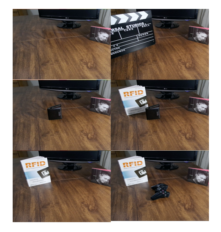
Figure 2: Real environment. Each frame represents the input end output objects in scene.

As expected, the LCD Monitor object was identified in the first moment of the capture but its presence in timeline cannot occur before the Start-Tag (Clapperboard). As Table 2 shows, the system identified two occurrences of the LCD