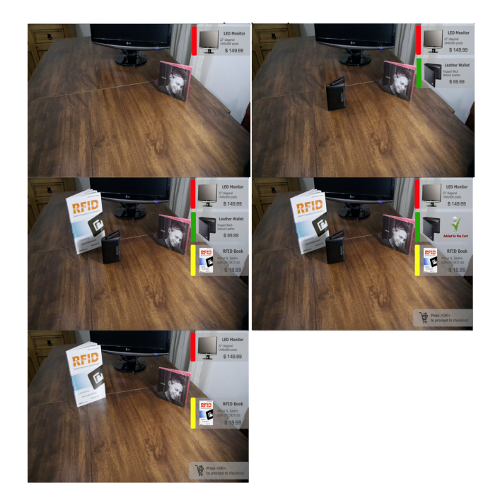
Figure 4: NCL example - Each frame represents the viewer interacting with the T-Commerce app to purchase the wallet

The items only appear in the TV for the viewer as they are detected in scene. Figure 4 exemplifies all the object detections and the interaction of the viewer in the iDTV application. The experiment simulates a wallet purchase by the user. The product is added to the cart and the buyer can then checkout. At this point the wallet is out of the scene, so the product is not offered again.