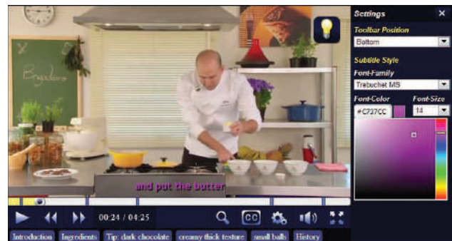
Figure 2. Facilitas Text configuration.

The search control allows the search of a word or phrase that appears in the subtitle text. The player will show all results and when a result is selected, it skips to that point on the video. For instance, in Figure 1, we searched for the word "butter", returning a set of two results. When a result is clicked, the player skips to that position.