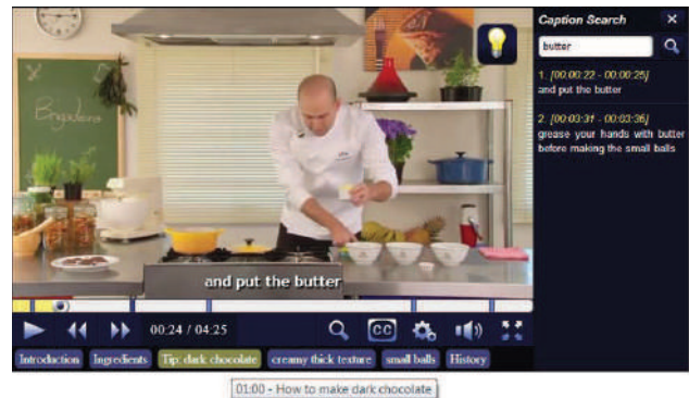
Figure 1. Facilitas Search Control and Tag Control.

Tag control allows the developer to add links to the video to divide it into parts. Each tag is linked to a specific time in the video. Tags provide a short description of the video content and a long description when it is selected, facilitating the search of videos. For instance, in Figure 1, the video has six tags. If we select "Tip:dark chocolate" tag, the video skips to the third tag time and a long description appear.