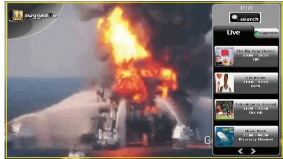
Figure 2. Recommended live programs.

The application runs on top of Java TV [5], which is a Java framework specially tailored for television systems. Java TV abstracts features such as retrieving broadcaster data, EPG and working with media players. The User Interface (UI) was created using the HAVi library, which provides a set of graphic components suitable for building UIs for digital TV applications.