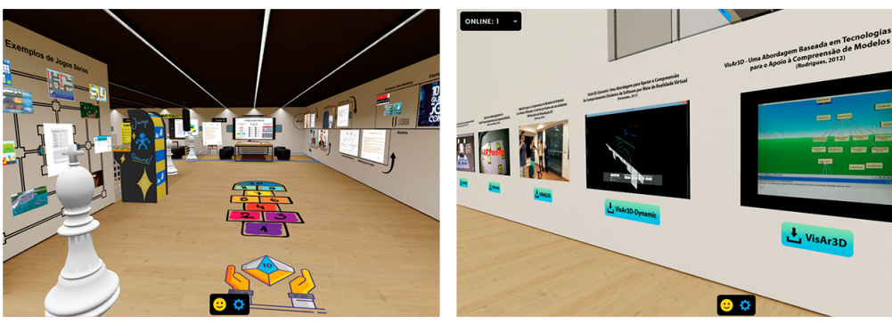
(a) Serious Game Zone