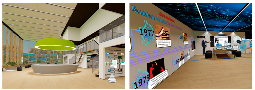
(a) Entrance Hall

As shown in Figure 2(a), when users enter the room via URL, they will find the entrance hall and a part of the zones with the instructional content. The user, through his/her avatar, will be able to explore the environment and go to the areas that contain the instructional content. Figure 2(b) shows the AVR zone, in which it presents some of the technology history through the evolution timeline and slides, also it shows some examples of AVR devices and some related videos and allows accessing a sub-environment that presents some application examples in several areas.