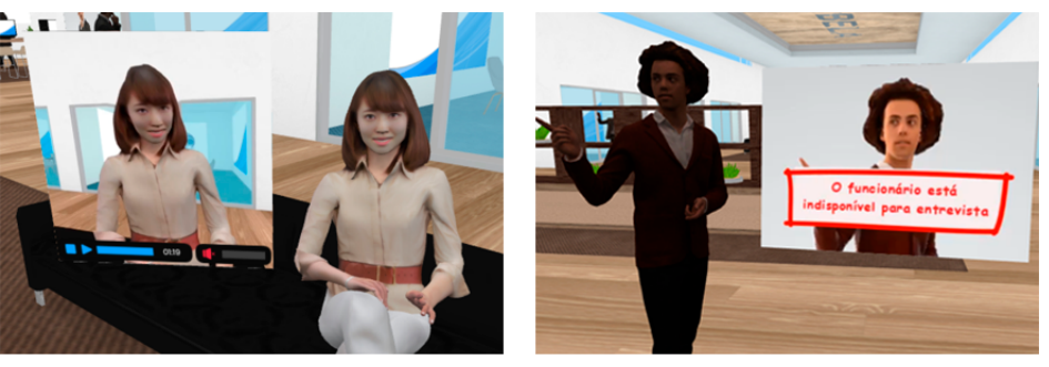
(a) Available for interview

With the virtual environment it was possible to simulate the interview activity in order to support the requirements elicitation practice. The environment simulates an office and has several avatars distributed, in addition to instructions on how to perform the exercise. The student's objective is to explore this environment and interview the avatars in order to create a requirements document for the development of an application that compares prices of products between supermarkets. In this way, the user needs to walk across the office, meet the avatars, click on the video to the side and hear what each one has to say. Figure 4(a) shows an example of an avatar available for interview. However, not all avatars are available. If an avatar is unavailable, the video displays the message that the employee is unavailable for interview, as shown in Figure 4(b). In this way, the student is obliged to "interview" all the avatars that are in the environment.