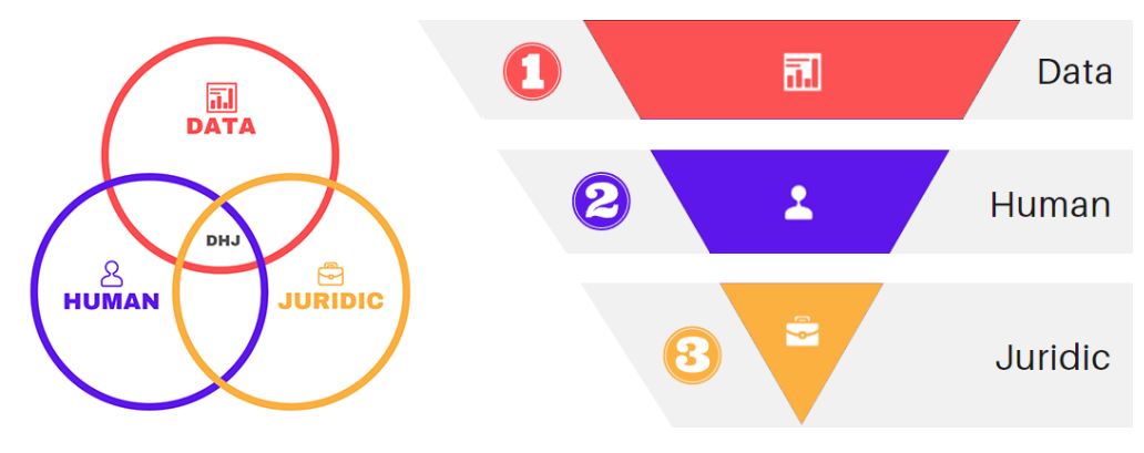
Figure 2. Data-human-juridic (DHJ) strategy

Based on the three strategies mentioned above, we proposed a strategy called DHJ (Data-Human-Juridic). This strategy (Figure 2) encompasses all three intending to further reduce cases of discrimination by AI applying three steps. The "Data" step proposes applying dataset training cleaning on input data. The next step ("Human") brings humans to the model learning process to detect possible discrimination committed during the learning process. But these methods do not prevent AI discrimination, then discrimination happened. To deal with it, we created the "Juridic" whose goal is to amortize its effects on people who can suffer from this. This can be done with specific laws that protect people from AI discrimination, such as article 22 of GDPR, applying punishments to responsible organizations and compensating victims.