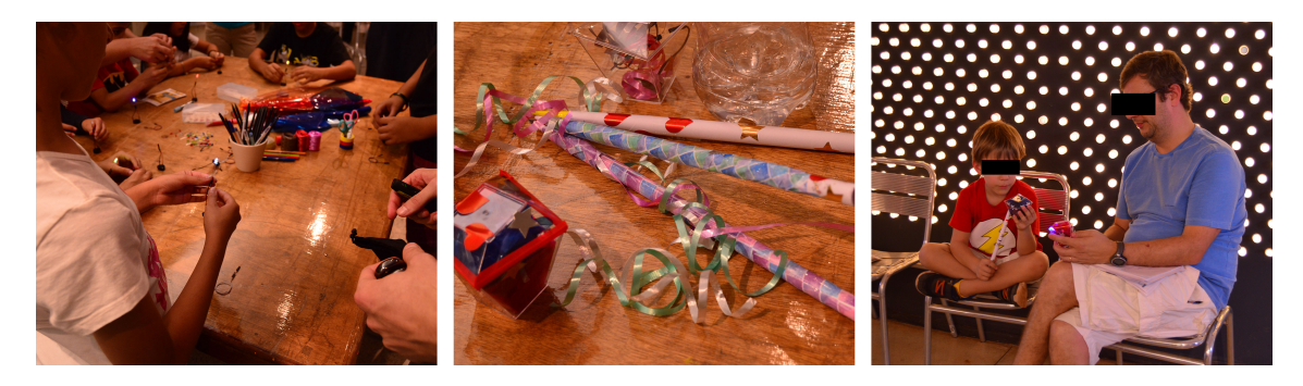
Figure 2. The construction of "magic potions" and "magic wands".

that could be activated by a "magic wand" (a paper wand with a magnet on the tip). The components are simple and affordable, costing approximately USD$ 1 for each pair of potion and wand. We guided the construction step by step, talking about the concepts involved ( e.g. , electricity and polarity of direct current found in batteries, as opposed to alternating current commonly found in power outlets). For the activity to be more playful and meaningful, we invited the participants to ornament their potions and wands with a variety of provided stationery materials. The construction phase is illustrated in Figure 2.