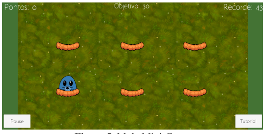
Figure 5. Mole Mini-Game

screen, yellow moles staying an intermediate time, and red moles staying a shorter time on the screen. The victory criterion would initially have a certain number of correct answers, and the defeat criterion would be a certain number of mistakes.