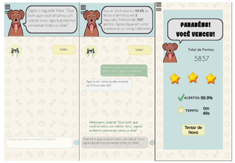
Figure 8. Screenshots of the mini-game that simulates an instant messaging application

• Do you have any suggestions to improve it and make it more fun?