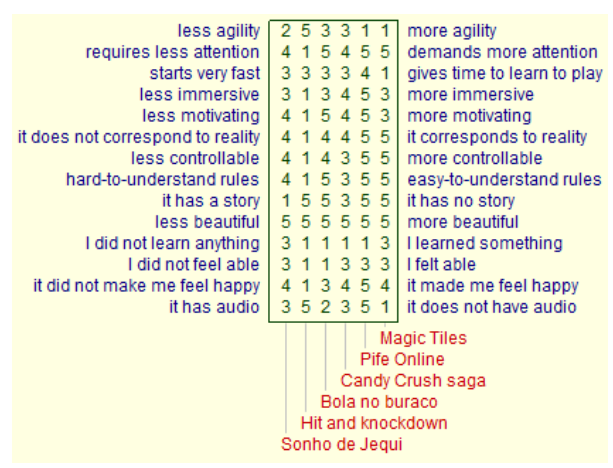
Figure 4. Repertory Grid generated for volunteer H

meaning and normalizing them with the same name requires careful analysis. Because of that, multiple coders chose one denomination for all constructs that had the same or similar meaning. All process was discussed and evaluated during meetings of the research group.