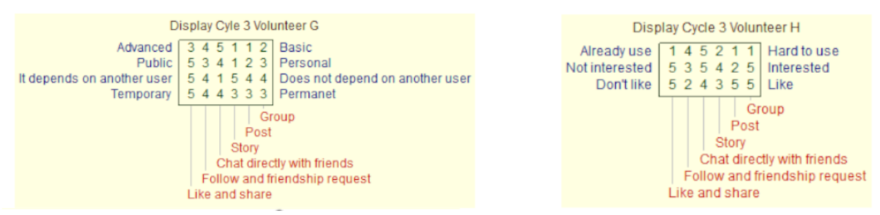
Figure 7. Two Repertory Grids generated for the third cycle