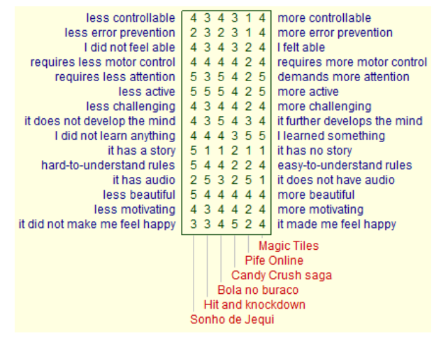
Figure 3. Repertory Grid generated for volunteer C

Identifying different user constructs with the same