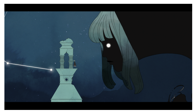
Figure 3. Screenshot from "Gris".

In addition to these topics, some works also incorporate themes of political interest, such as "Queer Digital Intimacies", which uses virtual reality to expose the nuances of queer experiences and identities. Works with similar approaches serve both as an artistic intervention and a call for reflection on death amidst contexts of war, social inequality, or the failure of the rule of law to guarantee the universal and inalienable right to life. Such is the case with the work "May Amnesia Never Kiss us on the Mouth" (See Figure 2), constructed in the social context of Iraq, Palestine, Syria, and Yemen to reflect on the value and how the lives of the populations in these countries are affected by wars. Similarly, "My Hands/Wishful Thinking" depicts the significant death of an immigrant killed in the United States due to police violence, racism, and xenophobia.