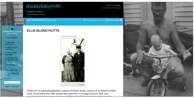
Figure 1. Screenshot from "Daddylabyrinth".

In terms of recurring approaches, there are some similarities observed in the body of works mapped out by this research. For instance, it is noticeable that "Inumeráveis" and "Imensuráveis" are two poignant specimens of how digital art can humanize statistics and transform death numbers in massive catastrophes into personal stories, where suffering, loss, and finitude have their intimate dimension underscored for the survivors. Both works are virtual memorials that pay tribute to the victims of the COVID-19 pandemic, presenting their names, age, and tributes left by family members, thereby turning statistical data through art into a touching narrative. In a similar vein, "Say Their Names" focuses on victims of police violence, giving each name or incident record a story, using digital media to create an ever-growing virtual mural, making the reality of police violence more visible and impactful.