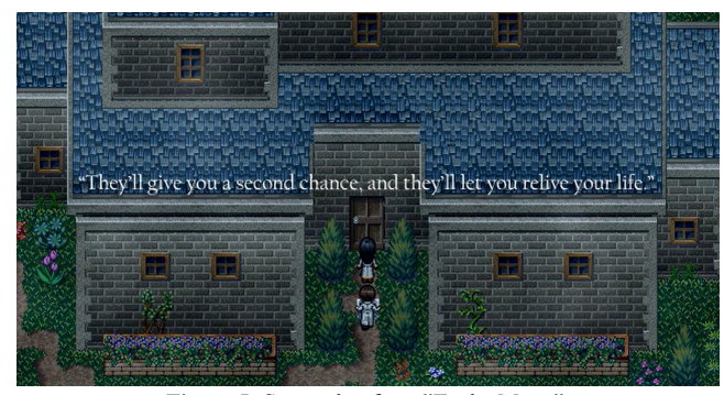
Figure 5. Screenshot from "To the Moon".

classic interactions and mechanics of the genre.