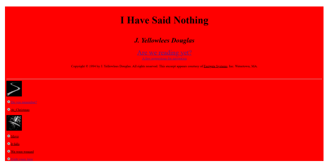
Figure 6. Screenshot from "I Have Said Nothing".

Moreover, there are works with sound technologies, such as "I have said nothing" (See Figure 6), which uses audio to craft an immersive experience, and "Gris", which employs music and sounds to create a melancholic ambiance, complementing the visual experience. Others, like "My hands/Wishful thinking" and "Death becomes the artist", crafted for the Adobe Flash Player media player, primarily rely on the use of images and animations to convey emotions and messages about the human life cycle, death, and immortality through memory. However, due to the obsolescence of Flash, these pieces can no longer be played in mainstream browsers, which shows some of the risks of inaccessibility digital art (and digital media in general) are subject to.