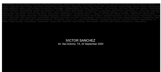
Figure 4. Screenshot from "Say their Names".

works such as "Say Their Names" (See Figure 4), "In a World Without Electricity", and "The Executor". These pieces rely on algorithms to produce variable content, thereby offering an interactive experience to the viewer, prompting them to reflect on the elements of the work, centered around death and mourning.