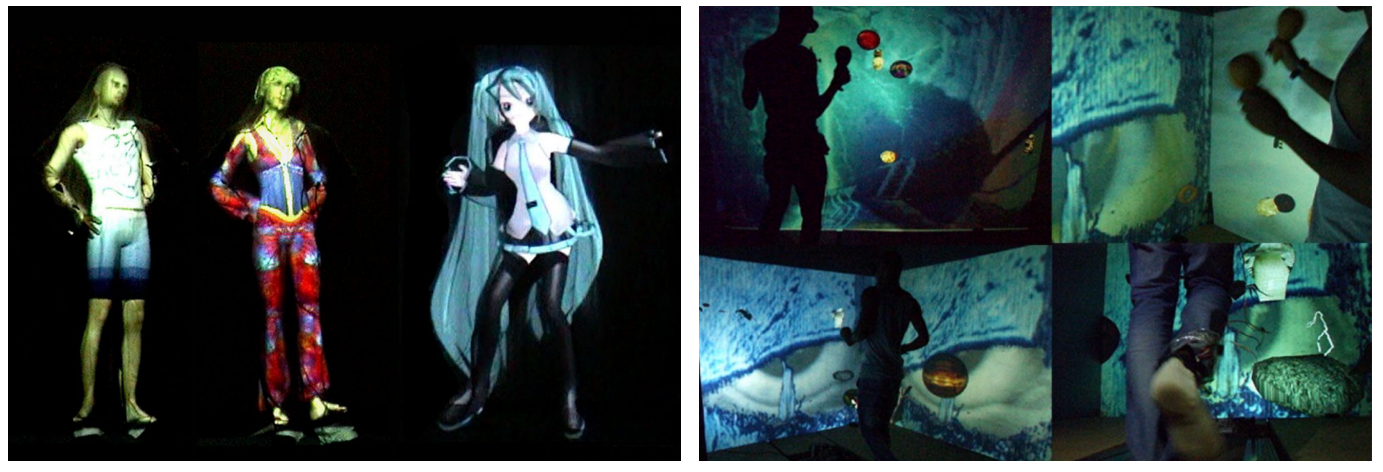
(a) iMorphia [14] (Art.CHI 2016 Archive).