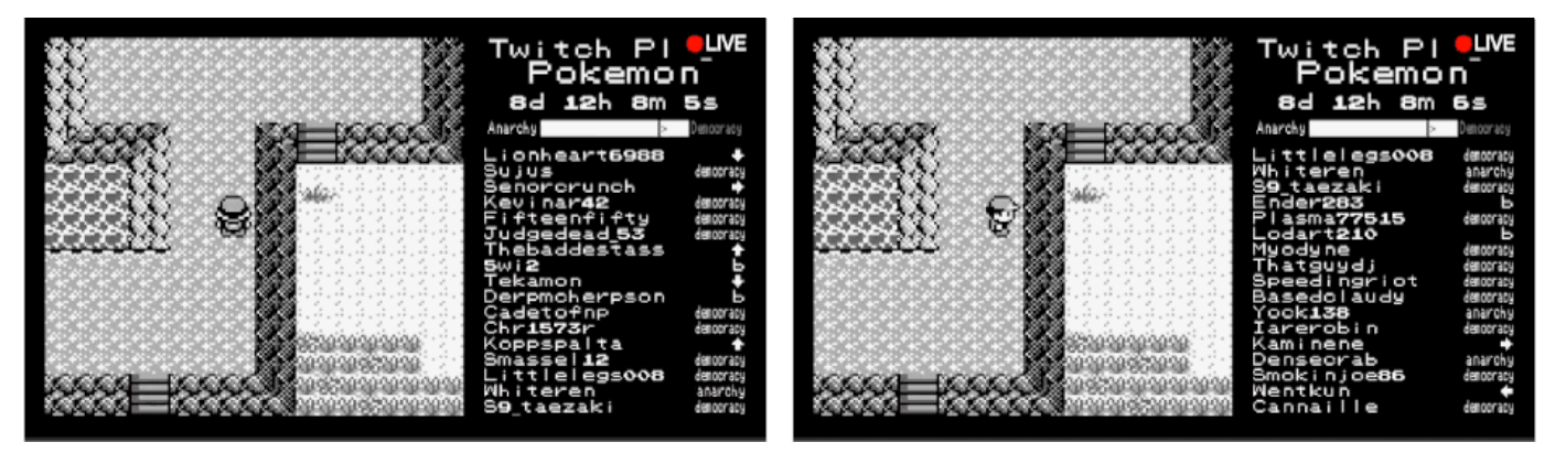
(a) Snapshots of Twitch Plays Pokémon.