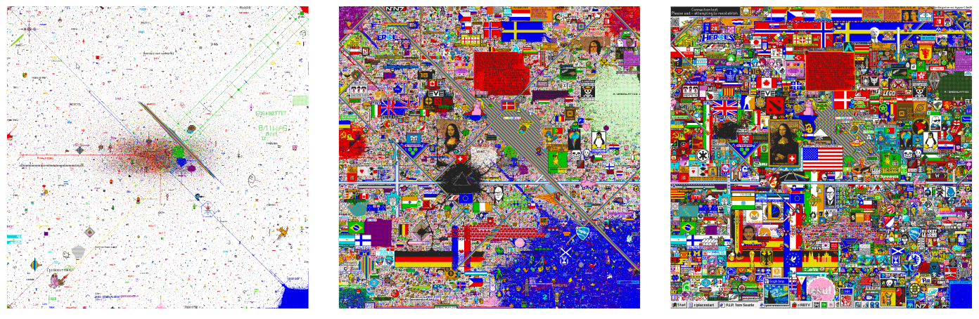
(b) Snapshots of Reddit's r/place canvas from beginning to end. Reconstructed from Albini's Archive [3].