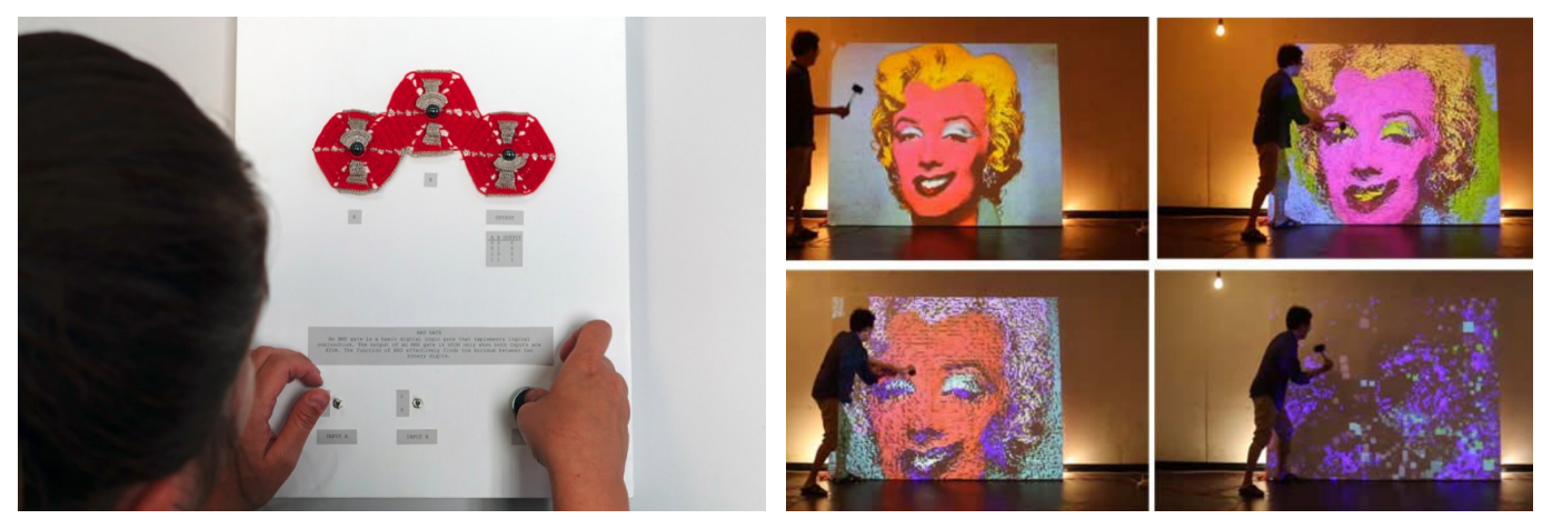
(a) Crafted Logic [83].