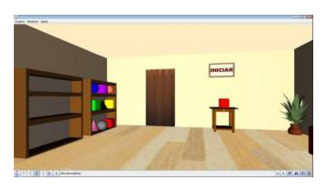
Figure 1. Example of the Smeck-3D scene for stimulating cognitive functions

An agent can be considered an autonomous system seeking different ways to reach pre-established goals in a real or virtual environment [8]. Every agent must have autonomy, which means that an agent must have the ability to manage its internal state and its actions to achieve their goals without human intervention. A multi-agent system is composed of two or more agents who have a set of skills and plans in order to achieve their goals. In order to develop these environments some serious games were developed aiming at improving the cognitive functions in patients with neuropsychiatric disorders [1]. The games were developed using agents, 3D and Virtual Reality technologies. They control the right and wrong answers, changing the difficulty level of the tasks according to the user performance. Figure 1 shows an example of the game scene.