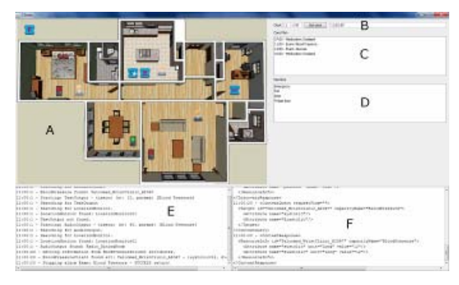
Figure 2. 3D Simulator for a remote assisted living application deployed in a smart home intelligent ambient

We developed a 3D simulator to help the developers of the context-aware infrastructure verify the system overall behavior (Figure 2). The developer can interact with the 3D vision pressing the on-off buttons or moving the patient's icon around the environment while checking if the Resource Agents and context information protocol are flowing as expected [9].