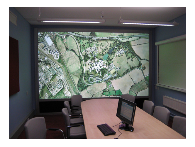
Fig. 2. 8k Auditorium at University of Essex