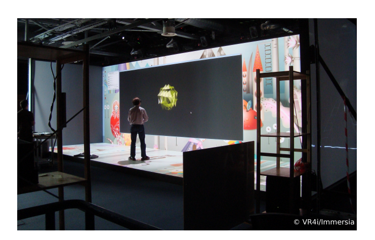
Fig. 3. One of the CAVEs at INRIA

of reality and greater sense of presence compared to other existing digital media formats. The NML [6] is an interdisciplinary laboratory focused on research and development for the deployment of UHD media applications over high performance communication networks. It is one of the few network connected UHD facilities in the world and is equipped with visualisation facilities for emerging 4K 3D and 8K media formats. Within the VISIONAIR framework, the NML is providing advanced network technologies for application-aware delivery of future networked UHD applications (including UHD VR applications) and remote collaborations between researches. In addition, it is providing access to its visualisation facilities as well as its extensive network infrastructure comprising connections to UK, European and International locations through 1 and 10 Gbps lightpath connectivity.